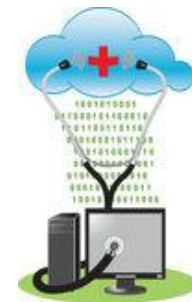
Figure 3. Cloud Anti-virus

It is cloud-based in the sense that files are scanned on a remote server without using processing power of the user's machine. Instead of having performing malicious analysis locally, the agent captures the relevant details from the endpoint and provides them to the cloud engine for processing. The processing of the data collected by agents on protected end-points is analysed by the servers of the anti-virus service provider. If malicious activities are observed on some endpoints in association with files not previously considered malicious, cloud anti-virus updates its perspective on those files.