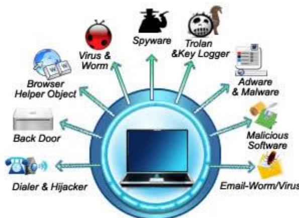
Figure 1. Viruses, Trojan horses and worms

Computers are very essential in our life, and since the first days of appearance of early viruses, there is a big contest between virus creators and anti-virus experts. A computer virus is a program that recursively and explicitly copies its evolved version. Computer Virus is a program file capable of reproducing its own special code and attaching that code to other files without the knowledge of the user. A virus copies itself to a host file or system area. Once it gets control, it multiplies itself to form newer generations.